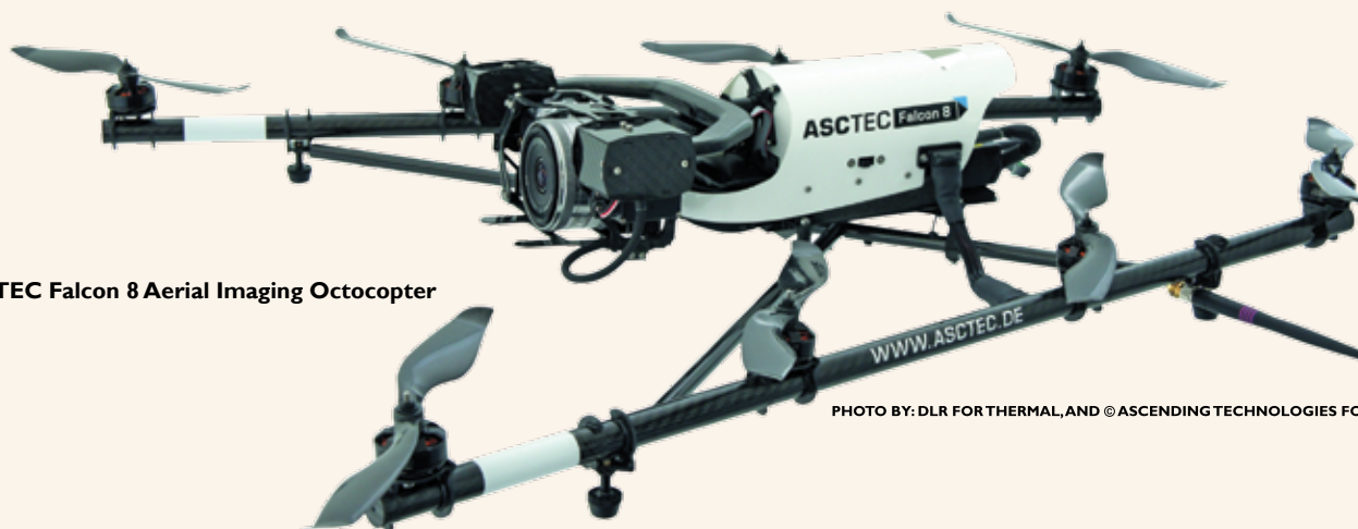
ASCTEC Falcon 8 Aerial Imaging Octocopter